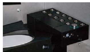
Tool changer for 10 mills