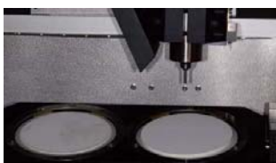
Tool support for 2 discs