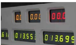
Automated calibration with 5 µm accuracy after each start